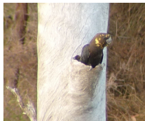
Adult female looks out from new nest "Slab".

66 nest attempts in 55 nest hollows have been recorded up to mid-June and 18 nestlings have been banded to date. Several pairs are on second attempts after failing to hatch their first egg of the season and more nestlings are expected in the coming weeks. Five new nest trees have been located and protected from possum predation with