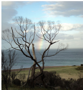
A new nest tree somewhere on the north coast.....

corrugated iron collars and three of these are in areas where there are no previous nesting records. With so many late nests, monitoring will continue through September. If you'd like to assist please let Mike know.