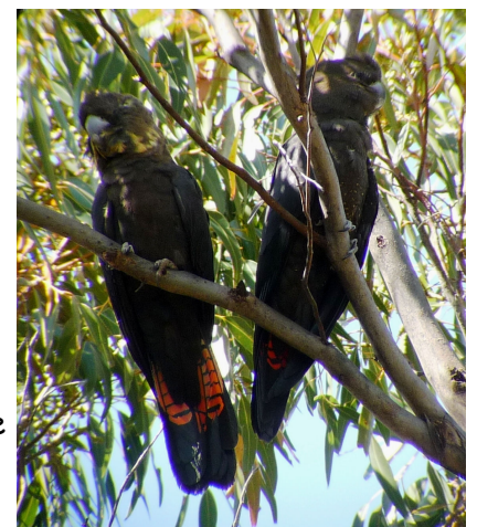
Adult female (left) with juvenile male at Western River during census 2010.