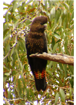
Juvenile female at Harriet River during census 2010.

A big thanks goes out to: Nature Foundation SA for providing the research grant that funded the 2010 census; Trish Mooney for assisting with the census, coordinating volunteers and co-authoring the census report; and to the 26 volunteers who contributed 111 hours of their time over the census period.